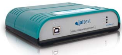
29347 Marine Link Interface